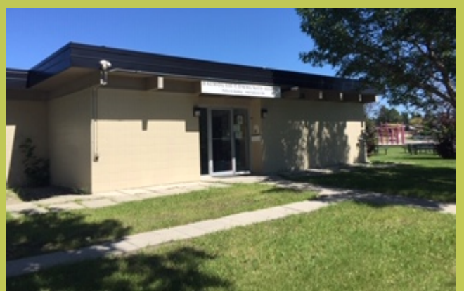
DALHOUSIE'S DALLYN ST. BUILDING - DALHOUSIE'S ORIGINAL COMMUNITY CENTRE CIRCA 1965

Reception/Events Booking: admin@dalhousiecalgary.ca, 403-286-2555